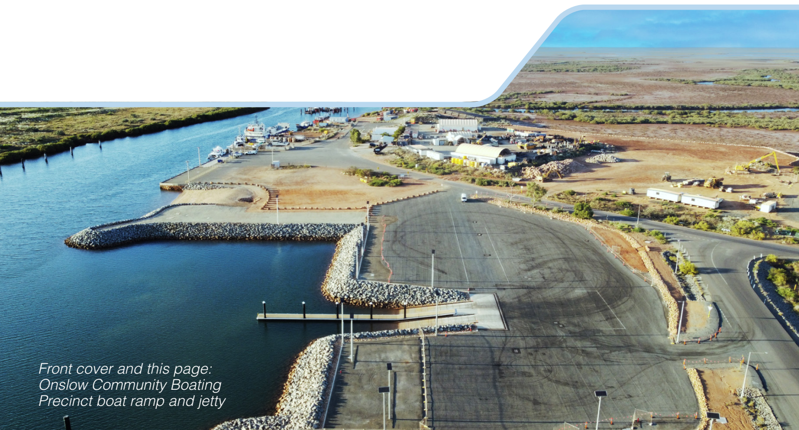
Front cover and this page: Onslow Community Boating Precinct boat ramp and jetty

The RBFS has approved funding to 464 projects over 27 grant rounds totalling approximately $49.4 million.