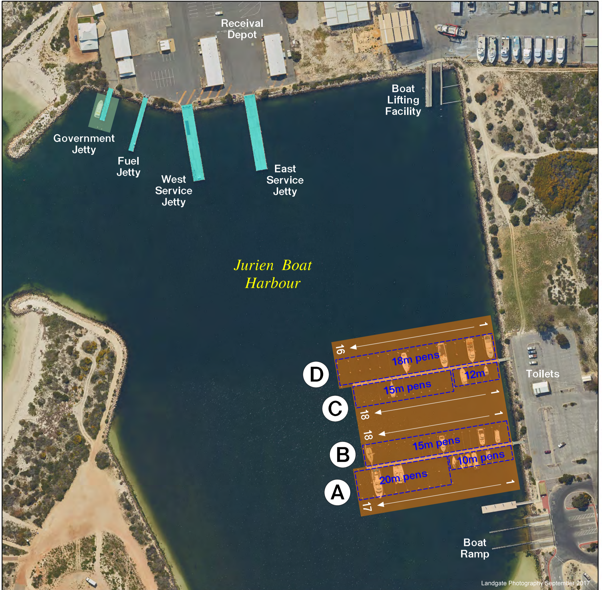
Landgate Photography September 2017