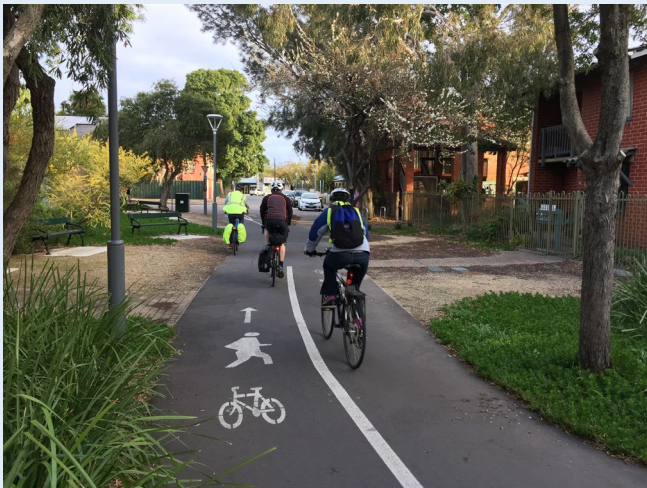
Bike riders using a shared path in the City of Vincent.

The City of Vincent developed their 2023-2028 Bike Plan with a vision for bike riding and walking to be safe, efficient and the preferred modes of transport for short trips to, from and within the locality. The outcomes of the plan were derived from community consultation, a saddle survey and Super Tuesday 1 data. Additionally, the plan undertook extensive work to further understand local context through assessment of traffic stress, current bicycle infrastructure and census data from the six differing neighbourhoods. Each neighbourhood had its own respective actions for the City to take, with levels of priority and the LTCN type that would be implemented (e.g. local route, secondary route). The City also evaluates the current network, community expectations, opportunities and potential improvements every 5-10 years.