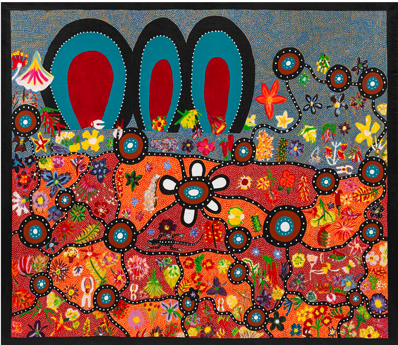
Image: 'Travelling through Country (Boodja)' , a collaborative artwork by Deanne Tann, Sister Kate's Home Kids Aboriginal Corporation and Department of Transport (DoT) staff following Cultural Awareness Training workshops.

We pay our respects to all members of Western Australia's Aboriginal communities and their cultures; and to Elders past and present.