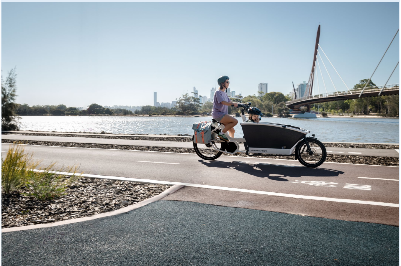
Bike rider using a cargo bike, travelling on a shared path in Victoria Park.

The City of South Perth and the Town of Victoria Park created a joint bike plan in 2018. This was funded through the Program and was the first example of a joint plan between LGs within WA. The plan had a desired outcome to increase the number of people riding within both LGs, specifically aiming to double it over the next five years. Both LGs undertook an analysis of crash data and locations, community engagement, and an audit on existing infrastructure.