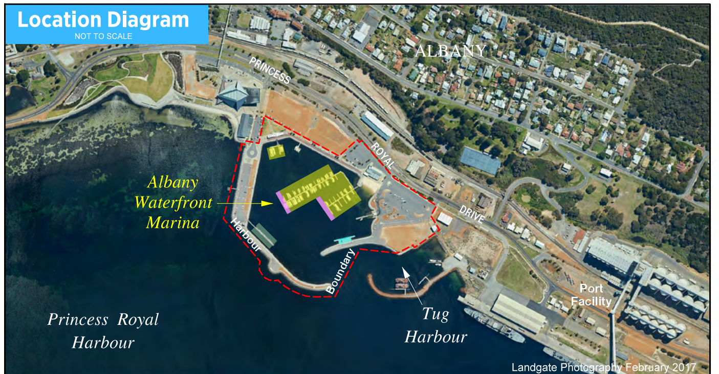
February 2017