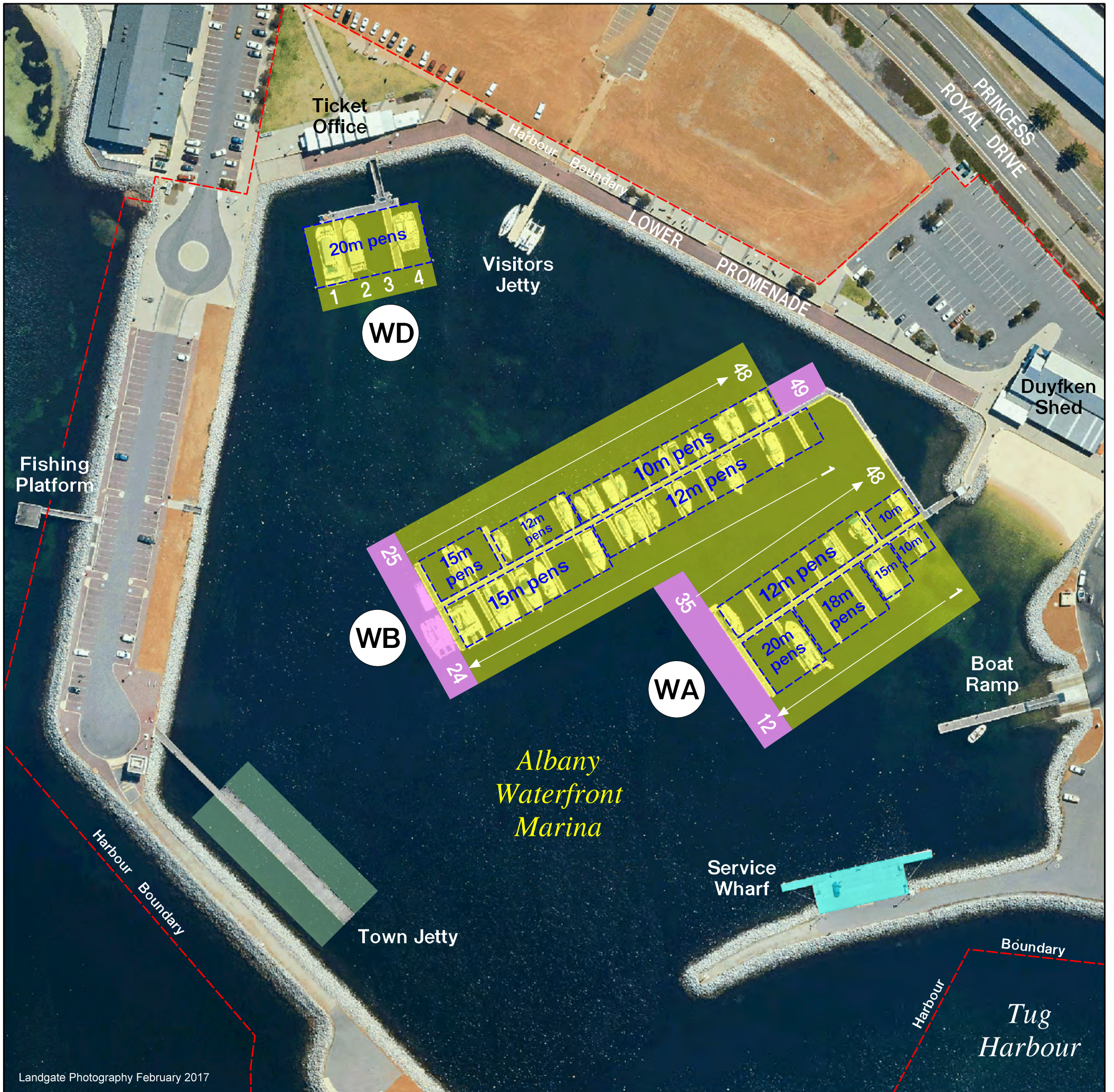
Landgate Photography February 2017