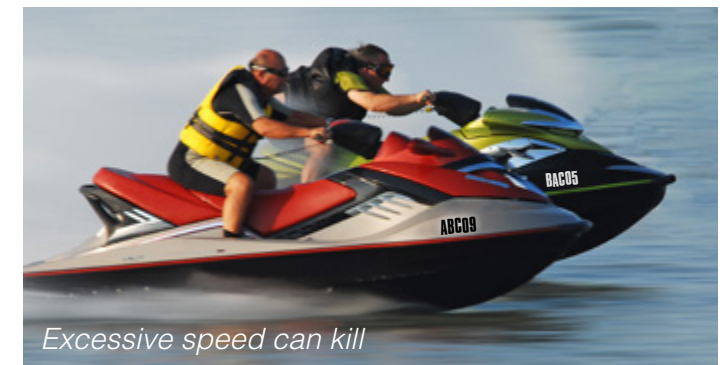
Excessive speed can kill