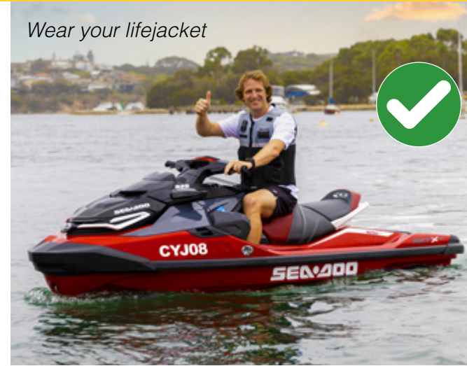
Wear your lifejacket

You must hold a Recreational Skipper's Ticket (RST) to operate a PWC. A skipper of a PWC aged between 14 and 16 years who holds a RST must only operate a PWC during daylight hours and at a maximum speed of 8 knots.