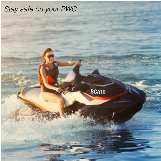
Stay safe on your PWC

PWCs are regarded as powerboats as far as the rules are concerned, meaning there are rules covering the age of skippers, safety equipment, speed and areas of operation.