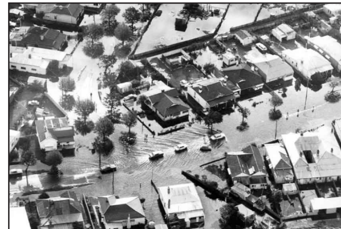
Flooding of Bunbury, Cyclone Alby 1978.

The barrier was installed in 1980 following flooding of Bunbury townsite during cyclone Alby in 1978.