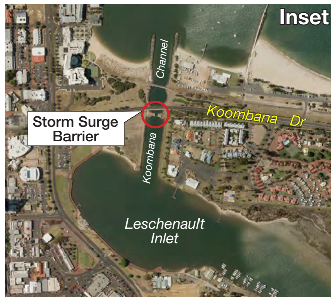
Location of the Bunbury Storm Surge Barrier.