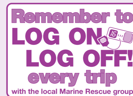
A Log On Log Off sticker is available from DoT. Position it near your radio as a useful reminder.

You say: This is (call sign or vessel rego) thanks OUT.