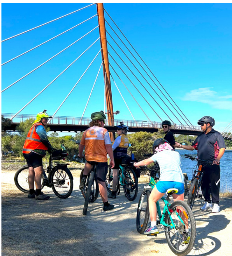
Participants in the Beeloo Riding Series

DoT has funded and is delivering a number of bike activation events that connect to Noongar culture. Two Boorloo Bike Quests occurred in April which involved a self-guided bike riding scavenger hunt exploring the significance of the Boorloo Bridge, and local Aboriginal sites in and across Perth. The Djeran and Beeloo Riding Series (involving events running until late May) is led by Wadjuk Traditional Owners and allows participants to discover Noongar cultural heritage, language, and stories in Poolgarla Park (Kings Park) and along the Derbarl Yerrigan (Swan River) and Djarlgarro Beelier (Canning River).