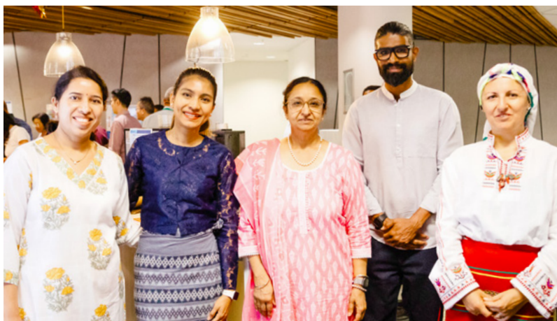
DoT staff celebrating Harmony Week.

DoT celebrated Harmony Week in March 2025 with workplace morning teas and lunches at several of our office locations, an internal newflash and email signature. As part of this, the SBS Inclusion – Cultural Diversity Awareness modules were promoted to all staff, along with internal training opportunities for staff covering topics such as cultural diversity and cross-cultural communication. We also acknowledged Harmony Day via a post on LinkedIn , which included promotion of the Transport Portfolio Multicultural Plan 2025-28.