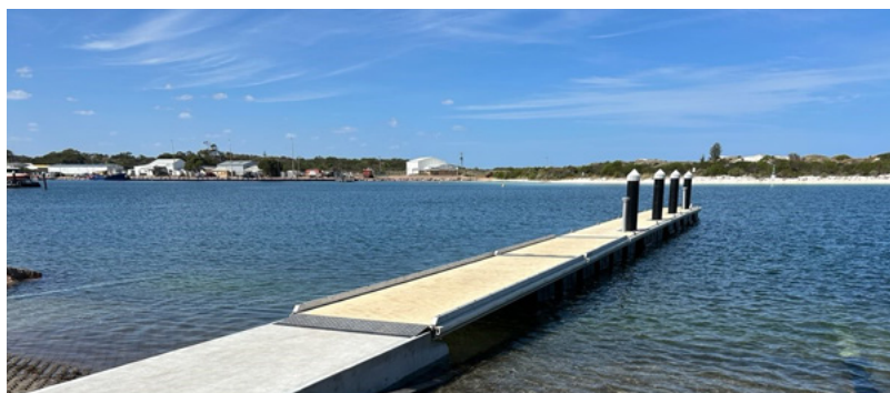
New finger jetty at the Bandy Creek Boat Harbour.

Replacement of the finger jetty at Bandy Creek Boat Harbour was completed in February 2025. The new floating jetty pontoon system significantly improves universal assisted access by way of all tide access and a wider jetty.